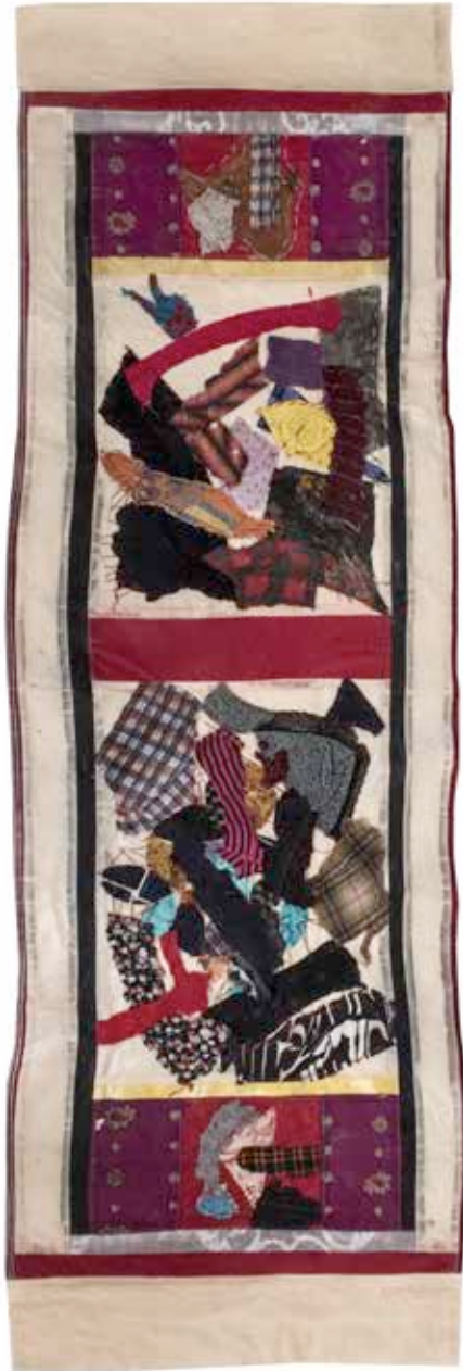
Carpet object / Switzerland / 2018 (227 x 72 cm)