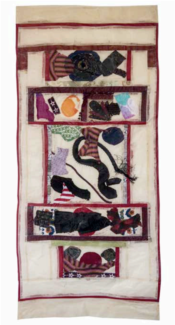
Carpet object / Switzerland / 2018 (224 x 92 cm)