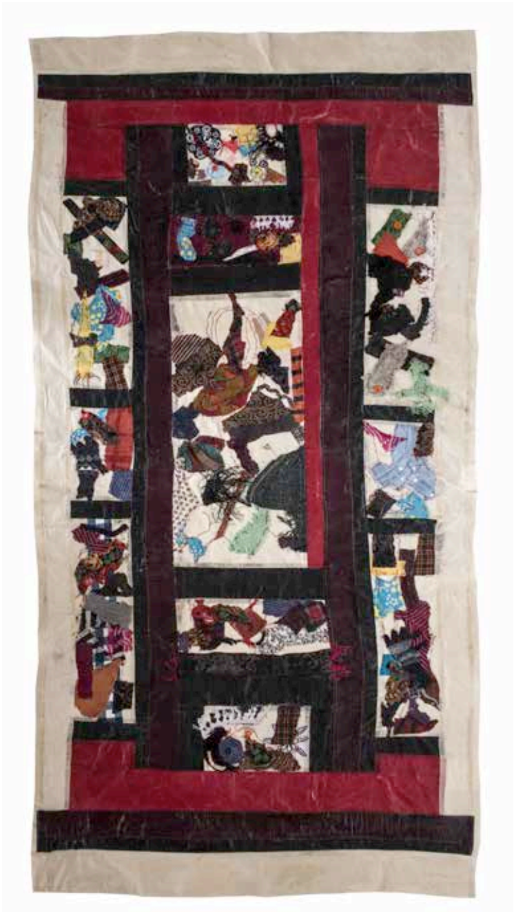
Carpet object / Georgia / 2018 (338 x 122 cm)