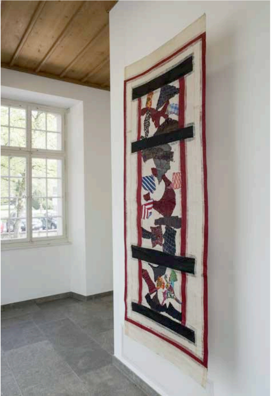
Carpet object / Switzerland / 2016 (220 x 86 cm)