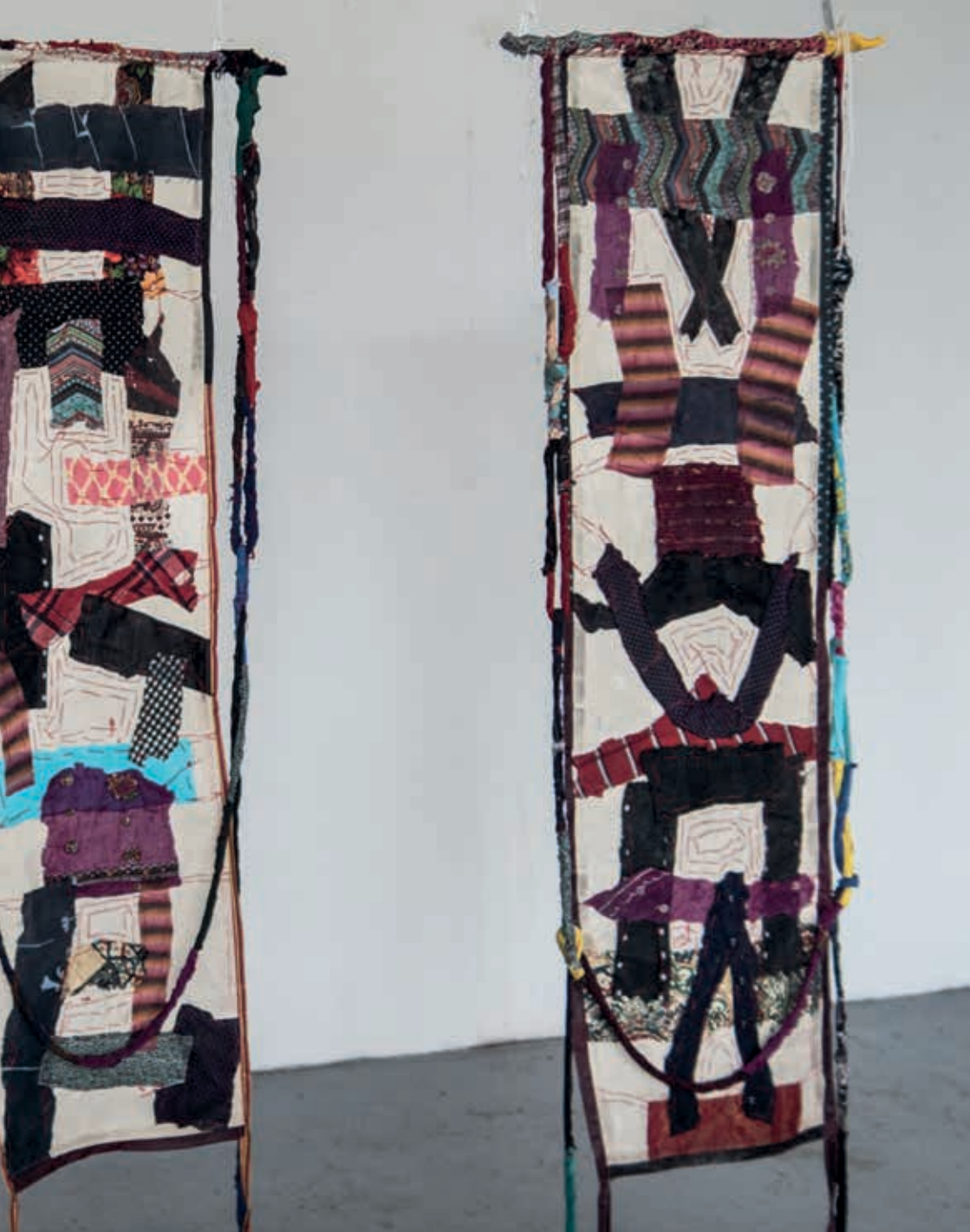
Interweavings / 2019 (each 200 x 65 cm / 230 x 140 cm)