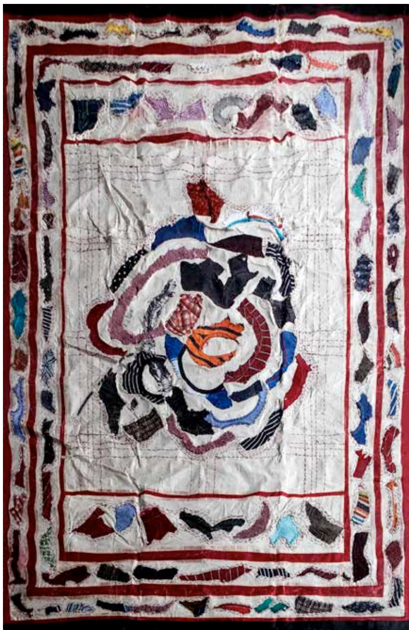
Carpet object / Switzerland / 2015-16 (315 x 205 cm)