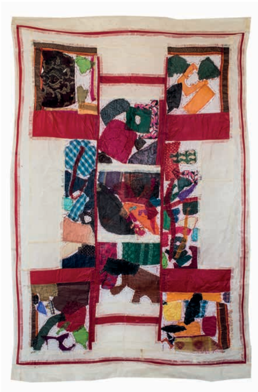
Carpet object / India / 2017 (234 x 154 cm)