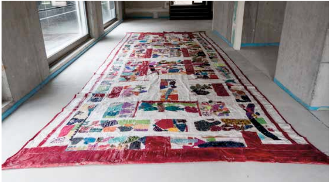
Carpet object / India, Switzerland / 2017 (700 x 310 cm)