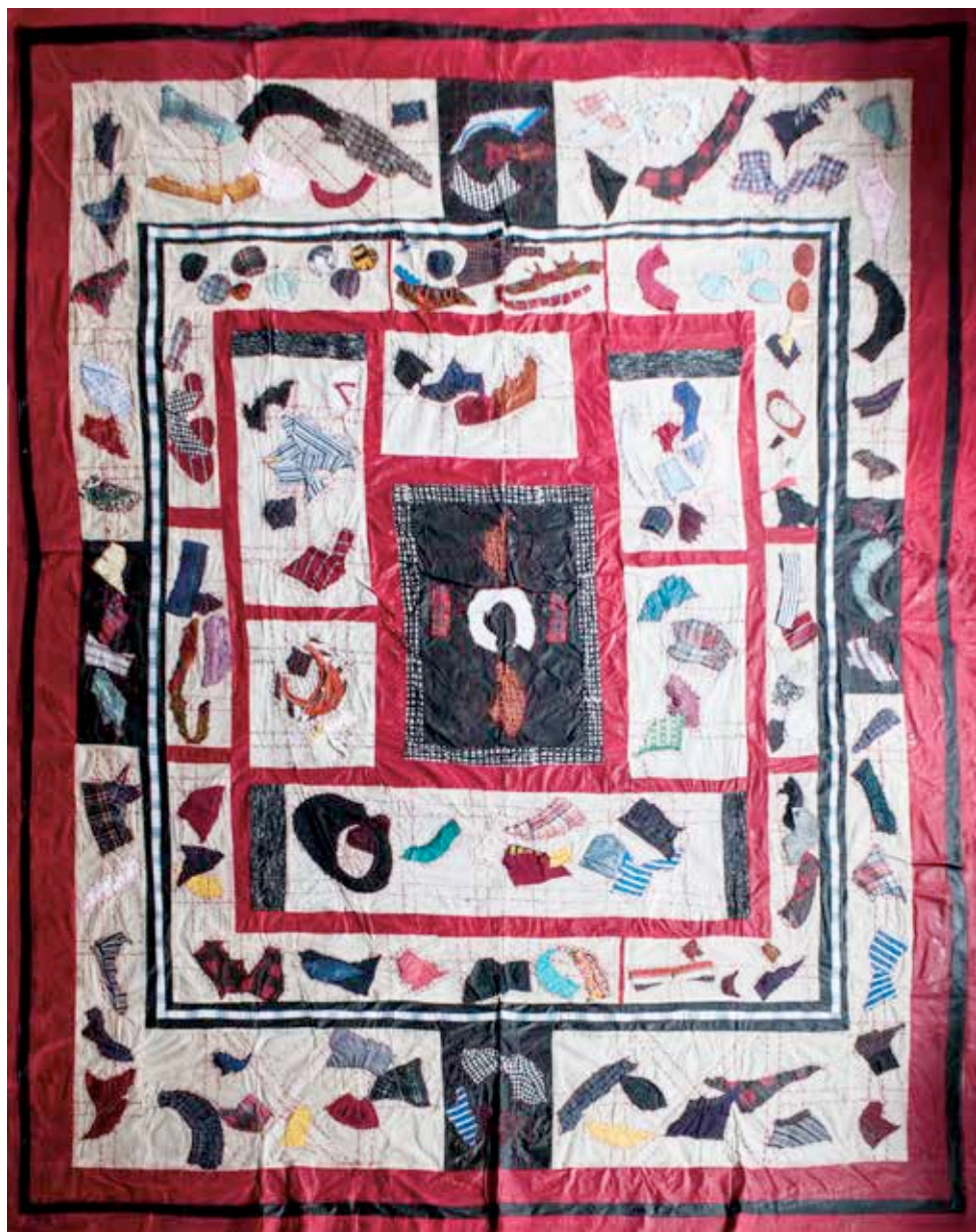
Carpet object / Switzerland / 2015- 16 (420 x 310 cm)