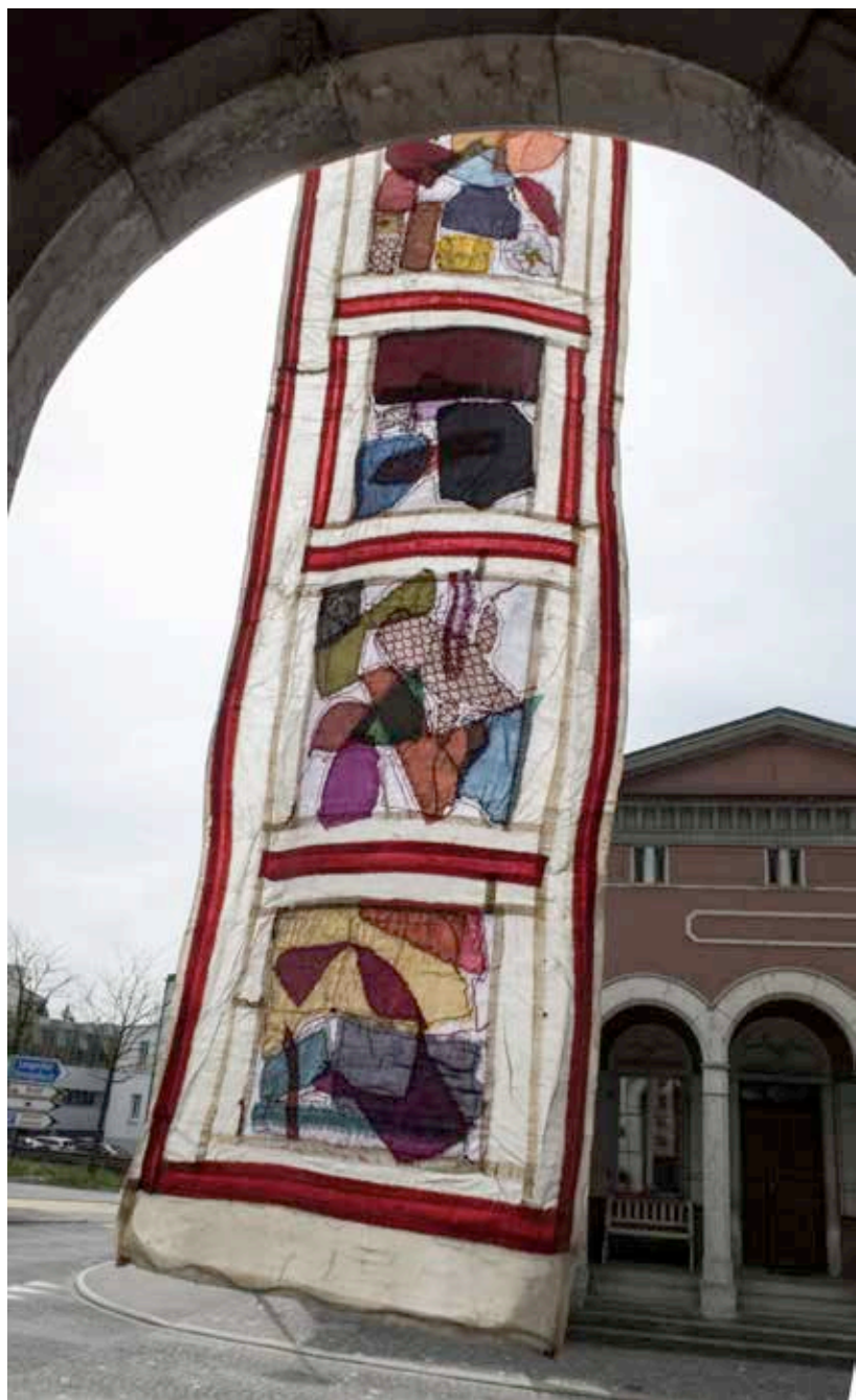
Carpet object / India / 2017 (315 x 75 cm)