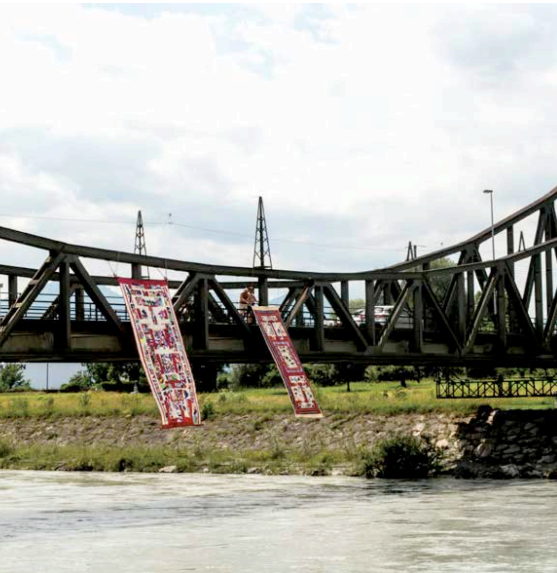
Living Fabrics / 2017 (Installation Rhine bridge)