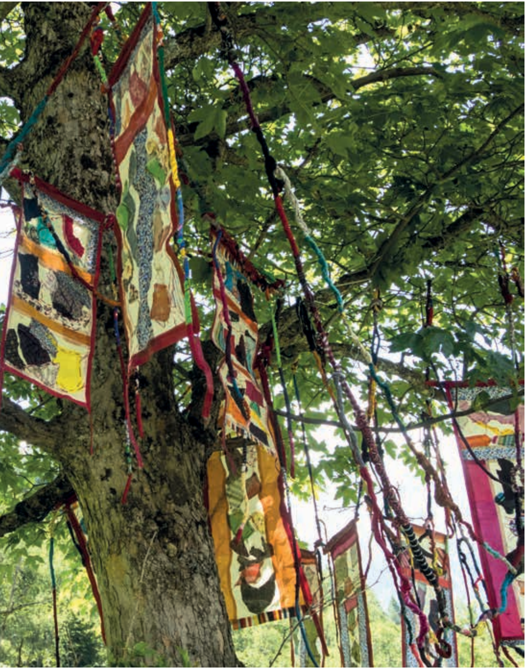
Interweaving / 2019 (Installation Landschaftspark Binntal, Wallis / Switzerland)