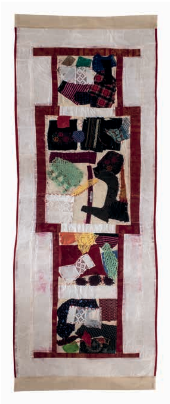
Carpet object 1+2 / Austria / 2018 (242 x 93 cm / 280 x 113 cm)