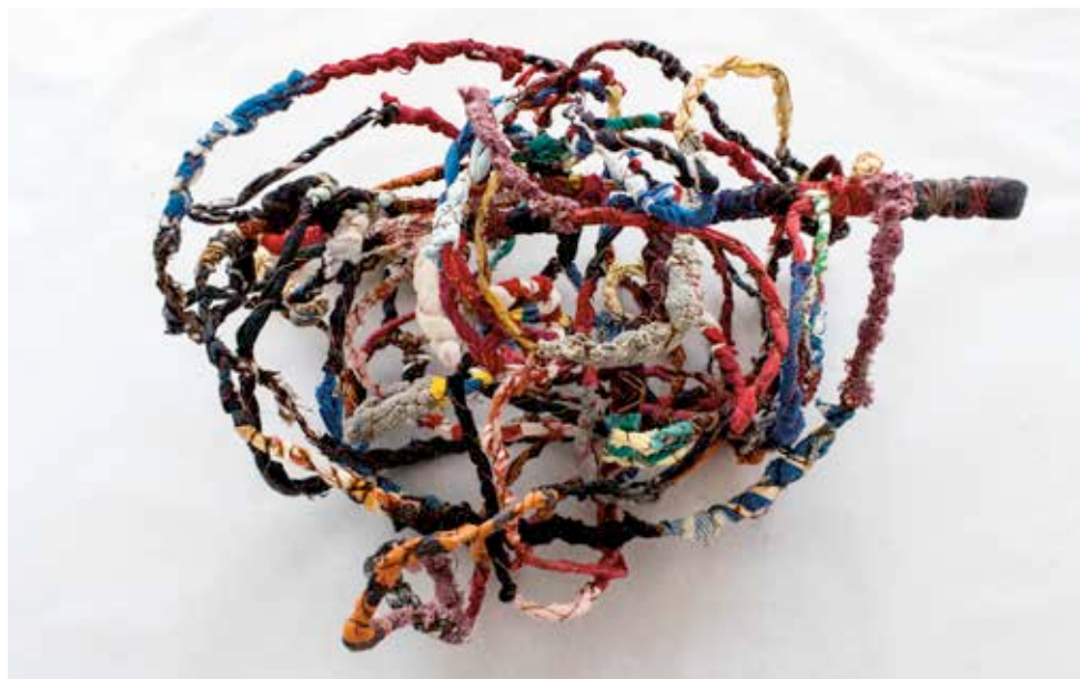
Gathering objects / 2016 (70 x 45 x 35 cm)