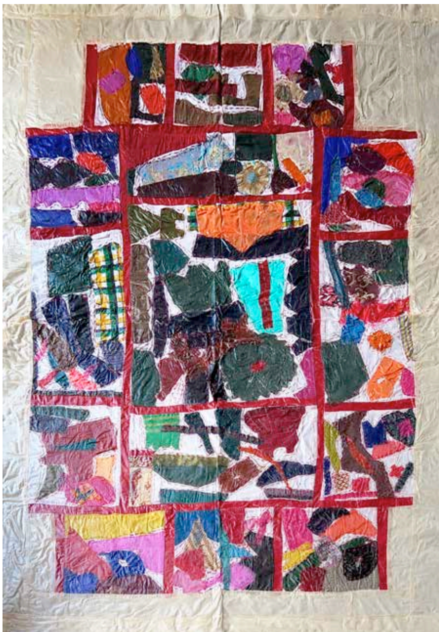
Carpet object / India / 2017 (320 x 200 cm)