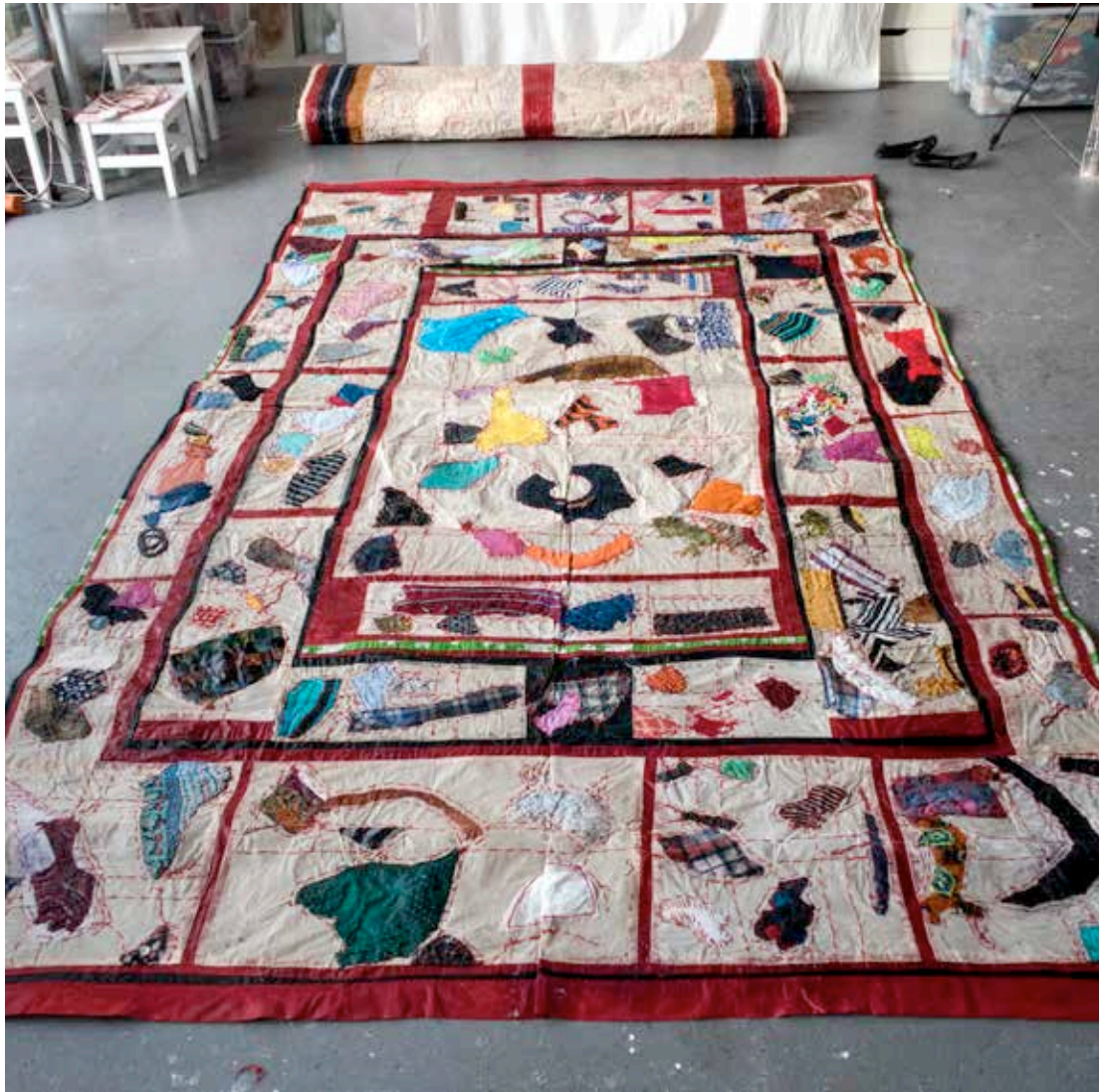
Carpet object / Switzerland / 2016 (365 x 215 cm)