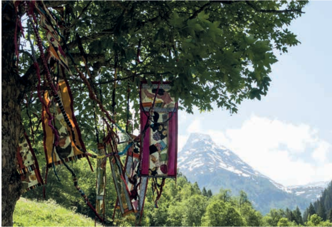
Interweaving / 2019 (Installation Landschaftspark Binntal, Wallis / Switzerland)