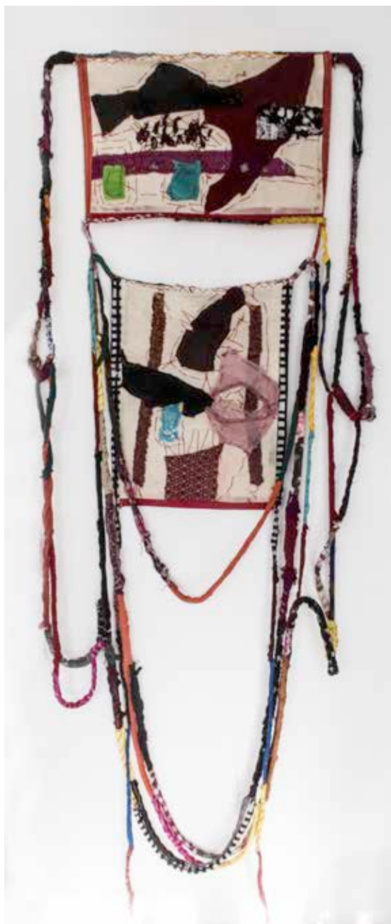
Interweaving / 2019 (200 x 80 cm)