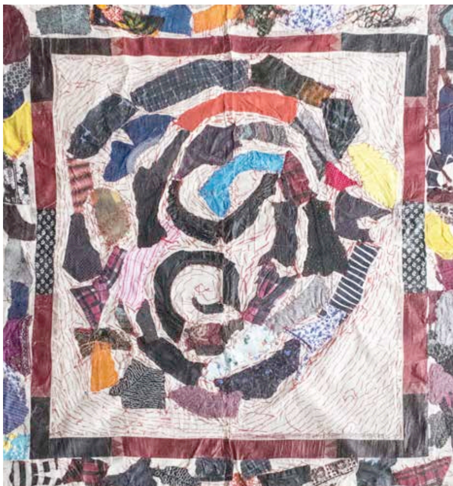
Gathering / 2019 (220 x 140 cm) / Carpet object / Switzerland / 2019 (340 x 200 cm)