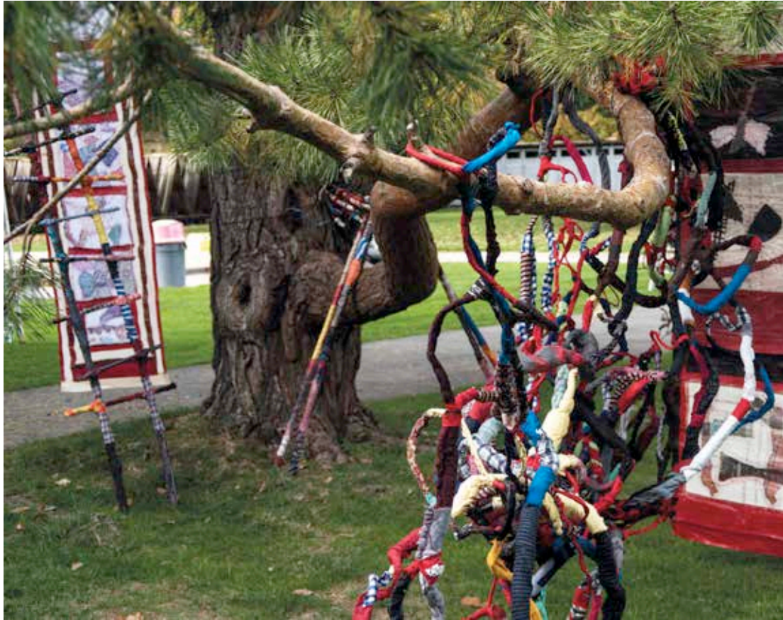
Gathering / 2017 (Installation Marzilli Berne / Switzerland)