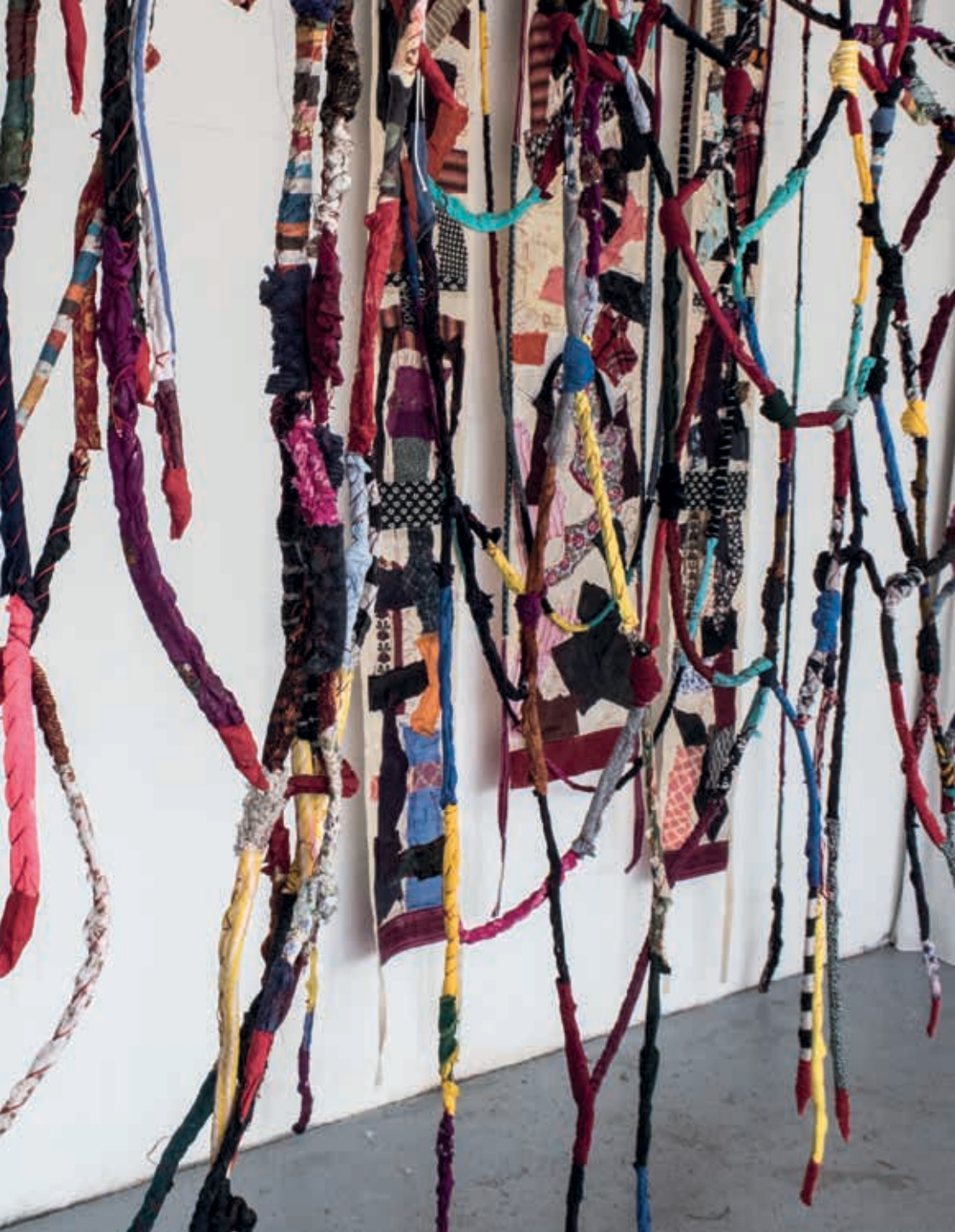
Interweavings / 2019 (Installation / Size variable)