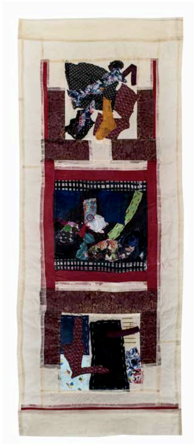
Carpet object / Switzerland, Austria / 2018 (190 x 77 cm)