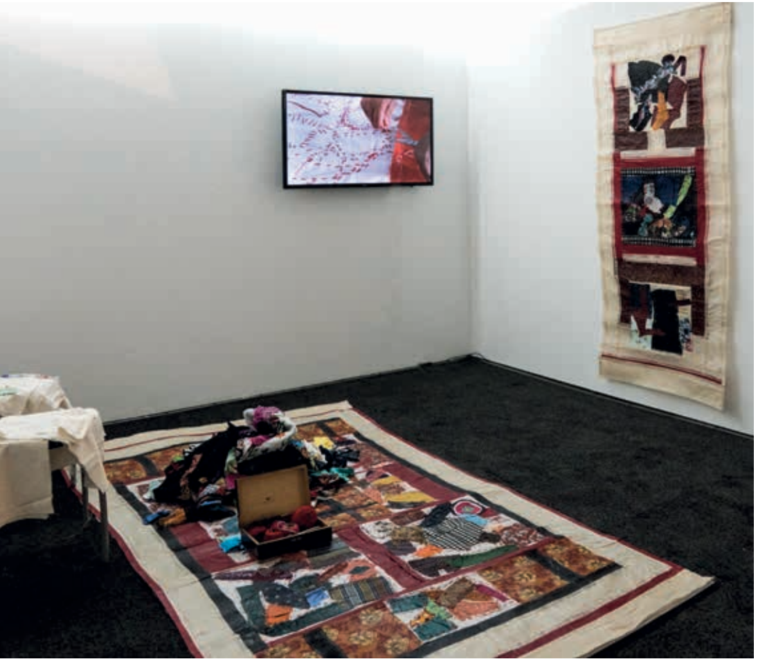
Carpet object / India / 2017 (234 x 144 cm)