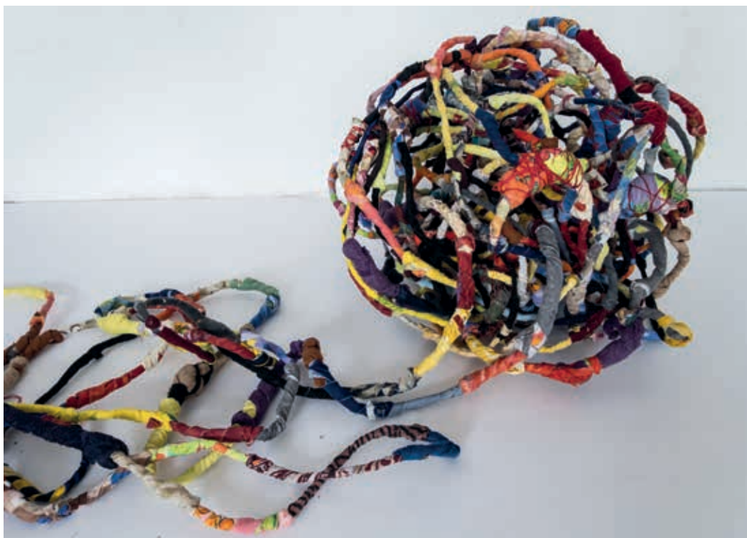
Gathering / 2019 / 150 x 65 x 50 cm